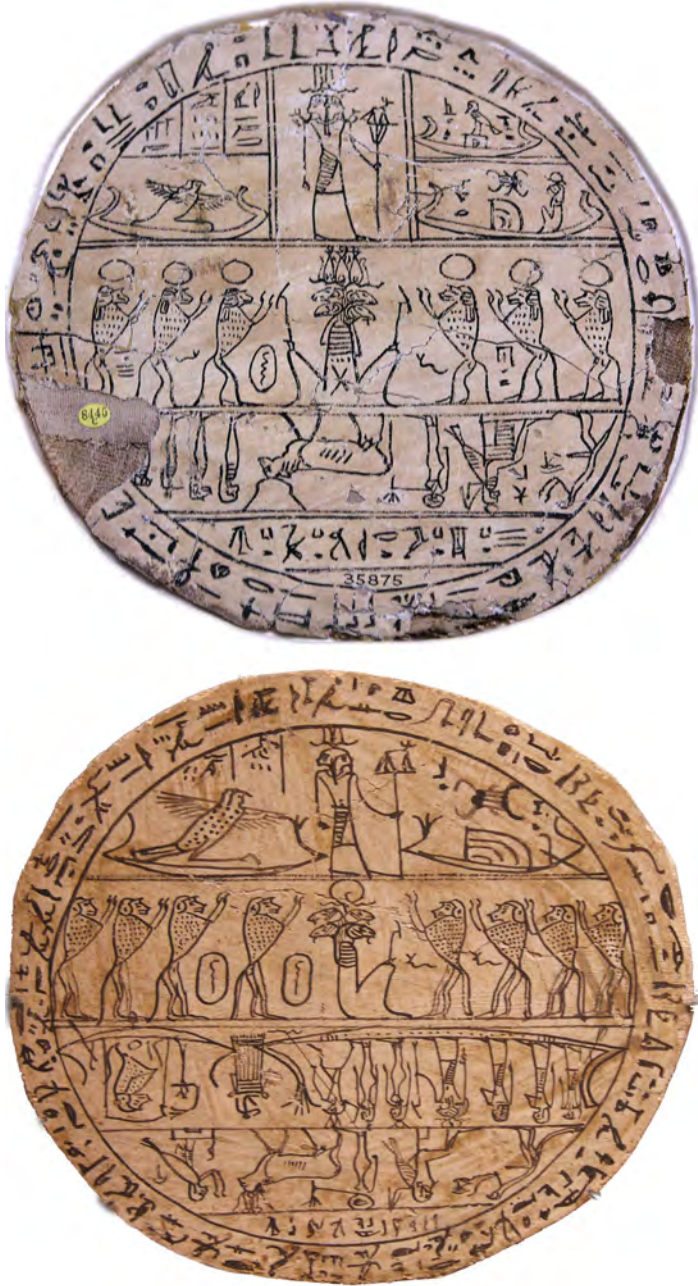
Figure 7. Two Egyptian hypocephali, representing circular depictions of the cosmos. Top: British Museum 35875 (formerly 8445c). Bottom: Louvre Museum E 6208. 129