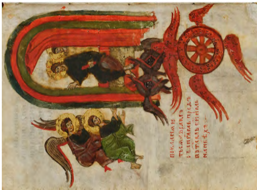
Figure 15. Abraham and Yahoel see the Lord face to face.