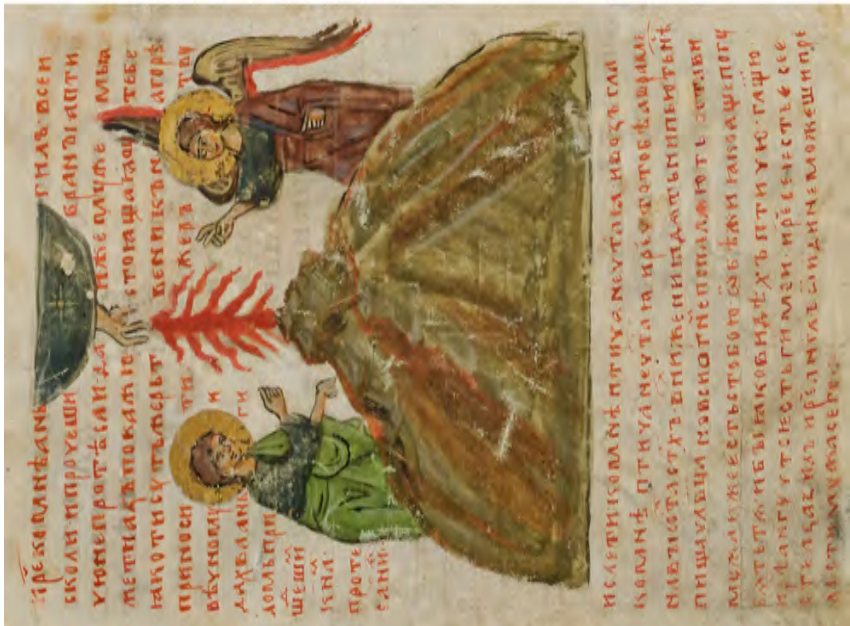
Figure 6. Abraham's sacrifice is accepted of the Lord.