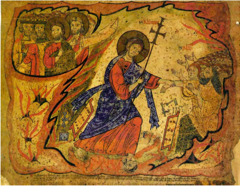
Figure 9. The Harrowing of Hell. The Barberini Exultet Roll , ca. 1087. 148 Note that Jesus is depicted as having two right hands, consistent with related accounts of God in Jewish midrash. 149