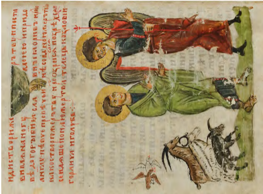
Figure 4. Abraham with sacrificial animals. Top: Photo of the facsimile version. Bottom: Photo of the Codex Sylvester.