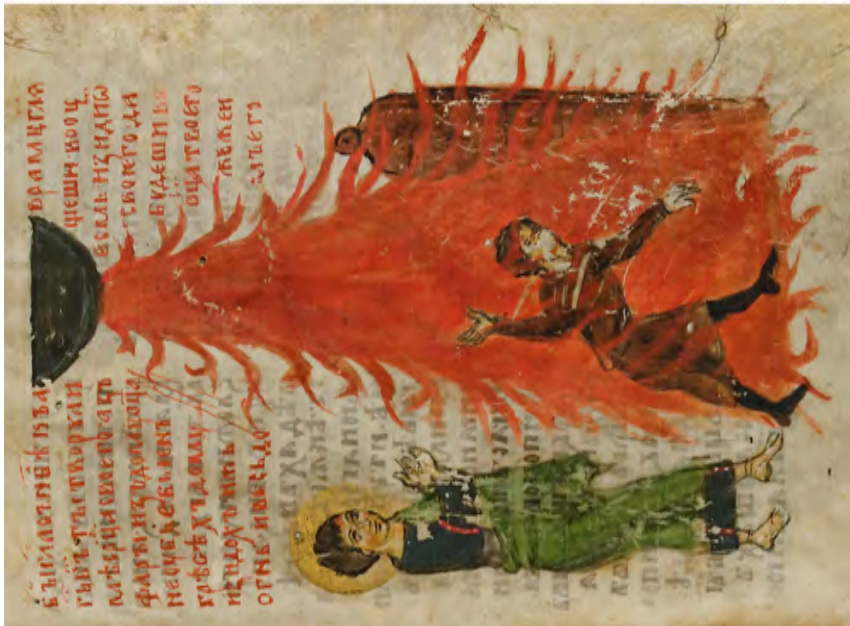
Figure 5. The house of Terah destroyed by fire.