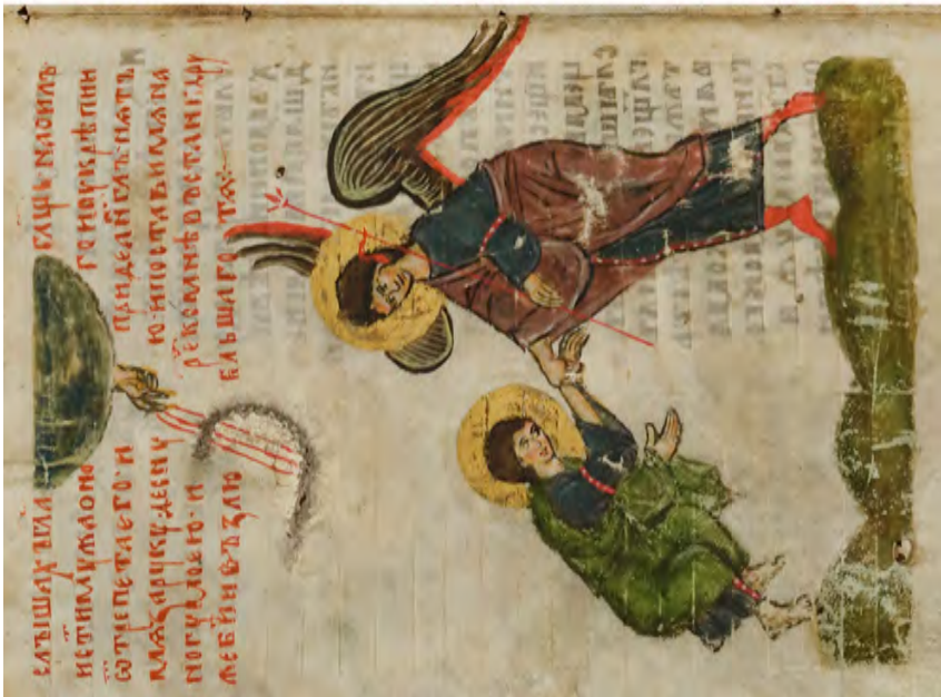
Figure 8. Abraham falls to the earth and is raised by Yahoel.