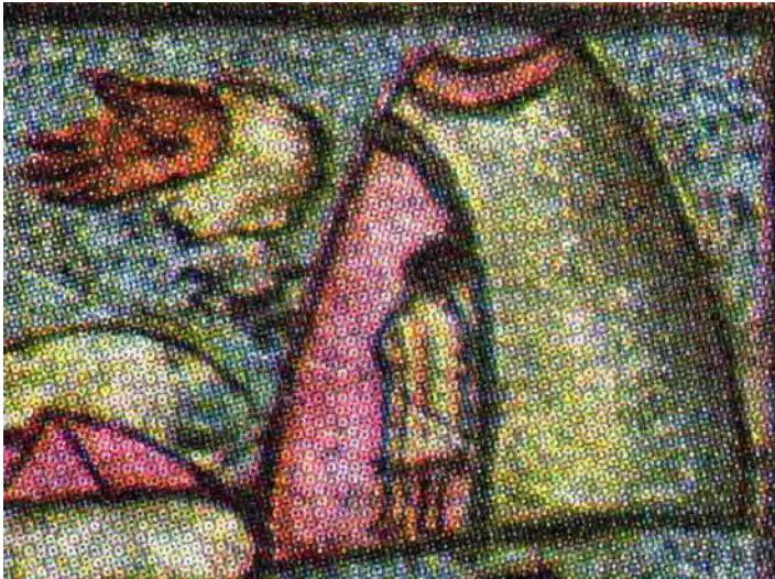
Figure 12. Detail above the Torah shrine of the Dura Europos synagogue. 201

Moses 1:25–31 describes Moses’s revelation of God as a progressive phenomenon, beginning with “a voice” and ending with a “face to face” encounter. Notably, the same sequence of divine disclosure is present in the story of the brother of Jared’s intimate encounter with the Lord “at the veil.” 202 In that account, the prayer of the brother of Jared is answered first with a divine voice (see Ether 2:22–25), then with the sight of the finger of the Lord (see Ether 3:6–10), and finally with a view of the “body of [His] spirit” (see Ether 3:13–20).