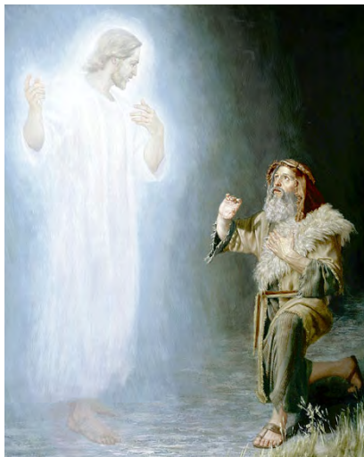
Figure 1. Joseph Brickey (1973-), Moses Seeing Jehovah , 1998. 42