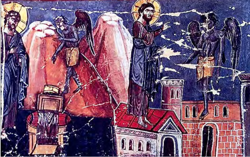
Figure 10. The Temptation of Christ. King Gagik I of Kars Gospels , ca. 1050. 159

the glory. He lost the glory when he fell, and he could take it on temporarily in order to deceive Adam and Eve.” 160 Thus, Satan is depicted in illustrations of the temptation of Christ, as elsewhere in early Christian art, as angelic in form but differing in color—for example, appearing in “false glory” in a blue tint rather than in a bright whiteness of glory (see figure 10). 161 One might also interpret Satan’s blue color as his appearing, deceptively, in a form corresponding to the blue robe of the high priest (worn here by Jesus), a robe that represented being clothed in the likeness of the body—the blue-black “shadow”—of the incarnate Logos. 162 By way of contrast, Satan is naked—his apron symbolizes counterfeit authority. 163