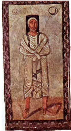
Figure 14. Moses with the sun, moon, and seven stars (that is, planets) above his head, from the Jewish synagogue at Dura Europos. 223 It represents Moses's recitation of a "hymn" near the end of his heavenly ascent. 224

In ApAb , Abraham is enjoined by the angel Yahoel to recite a "hymn" in preparation for his heavenly ascent to receive a vision of the work of God. 225 Unlike other pseudepigraphic accounts of heavenly ascent, ApAb "treats the [hymn] sung by the visionary as part of the means of achieving ascent." 226 Near the end of Abraham's recitation, he implores God to accept the words of his prayer and the sacrifice that he has offered, to teach him, and to "make known to your servant as you have promised me." 227 Then, "while [he is] still reciting the [hymn]," the veil opens and the throne of glory appears to his view. 228