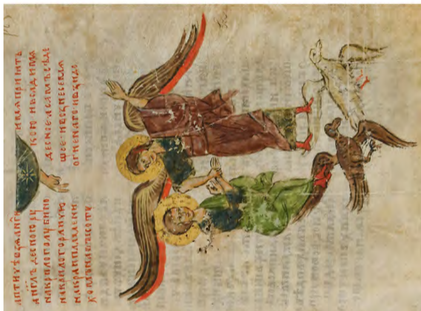
Figure 11. Abraham and Yahoel ascend to heaven on the wings of two birds.